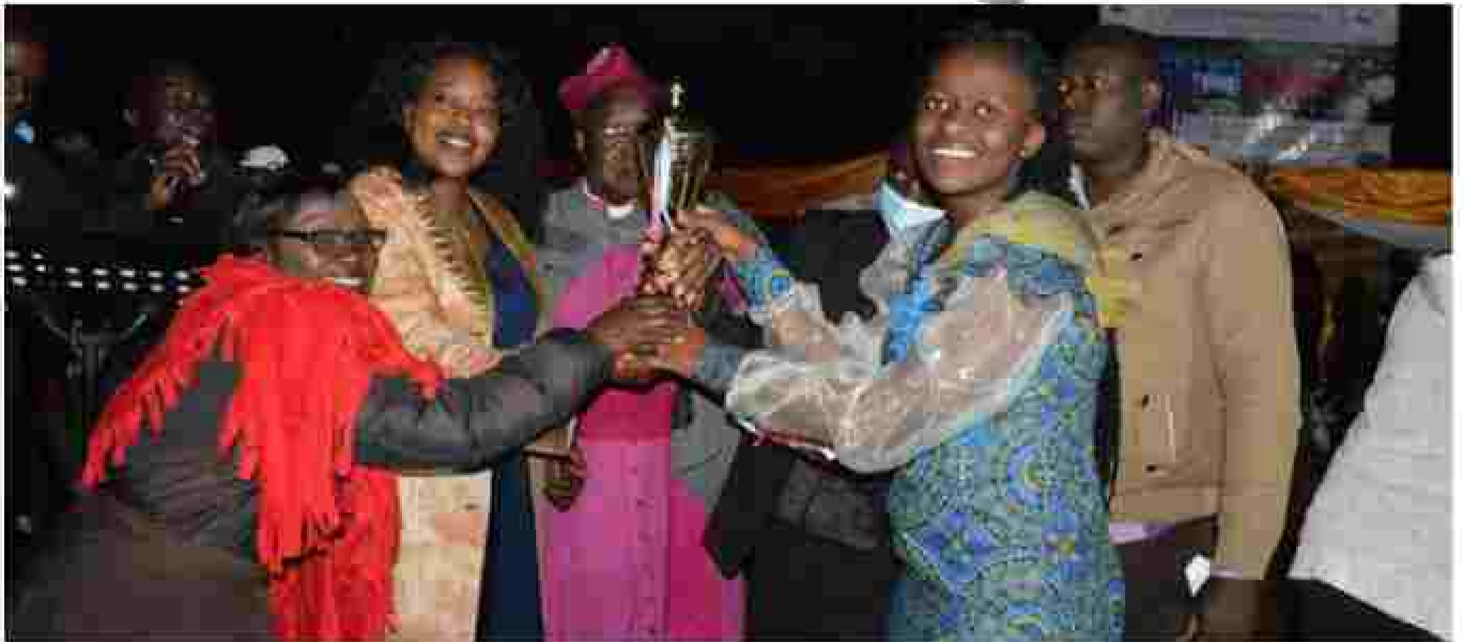
St Joseph Choir displays their trophy