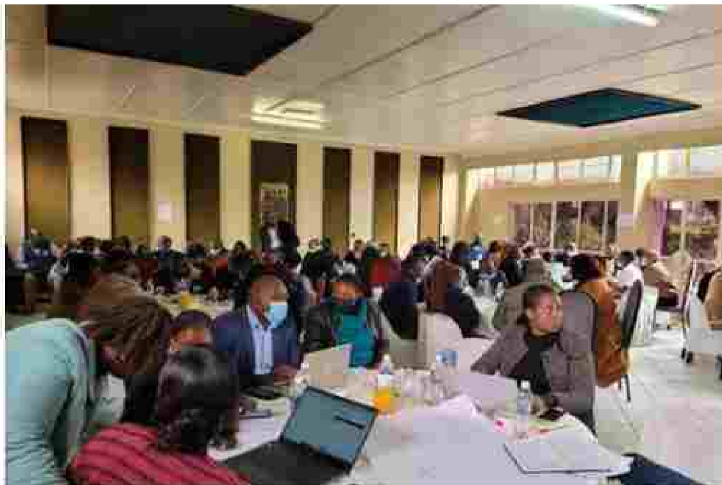
Participants at ZTA Indaba